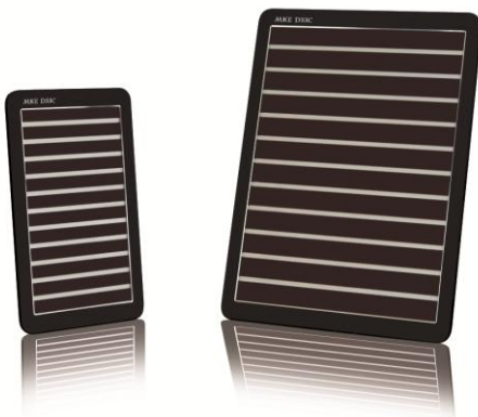
MKE DSSC 7