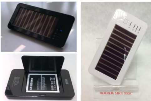
CellBox –Best Phone-Mate